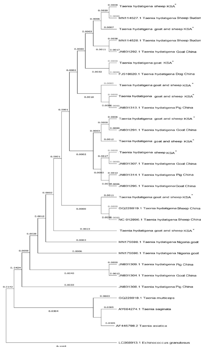
Fig. 3. Phylogenetic relationship calculated by NJ method from the partial cox1 gene nucleotide sequences. E. granulosus represents the out-group strain. The scale bar corresponds nucleotide substitutions per site.

Mitochondrial DNA is characterized by no recombination, maternal inheritance pattern, conserved regions, rapid mutation rate and a relatively high rate of evolution. Therefore, it has been widely used in investigation of the genetic variation of metazoans (Brown et al., 1979; Mueller et al., 2004; Shen et al., 2010; Wei et al., 2010). Our analysis of complete sequences for cox1 gene revealed a considerable degree of genetic variation of T. hydatigena isolates from sheep and goats collected from a slaughterhouse in Makkah, Saudi Arabia, in contrast to the commonly employed partial gene sequences (Braae et al., 2015; Boufana et al., 2015; Adwan et al., 2018; Kilinc et al., 2019).